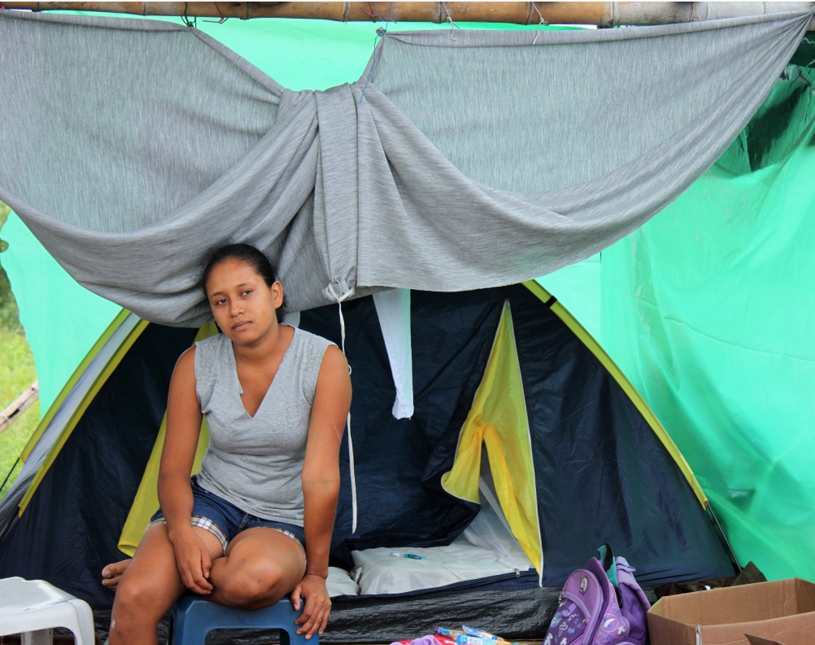
People displaced by the earthquake in Ecuador in 2016 have sought shelter in displacement.

To be effective, DRR and humanitarian assistance efforts need to address the risk and impacts of disaster displacement. In doing so, they should recognise that people already displaced by previous disasters or conflict, including refugees, and the communities that host them tend to have less capacity than their counterparts in the general population to cope with a disaster's impacts and manage future disaster risk.