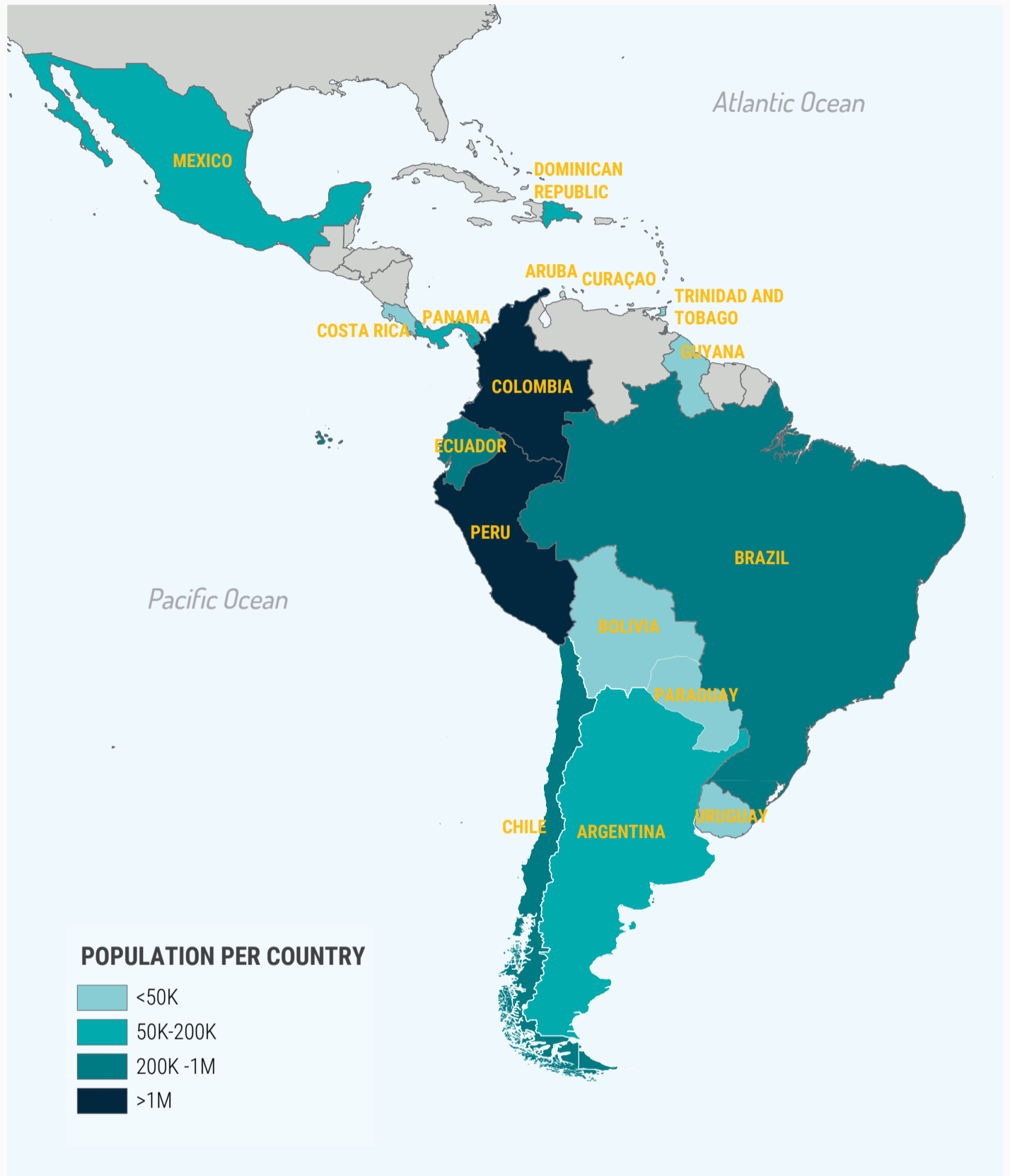
POPULATION PER COUNTRY