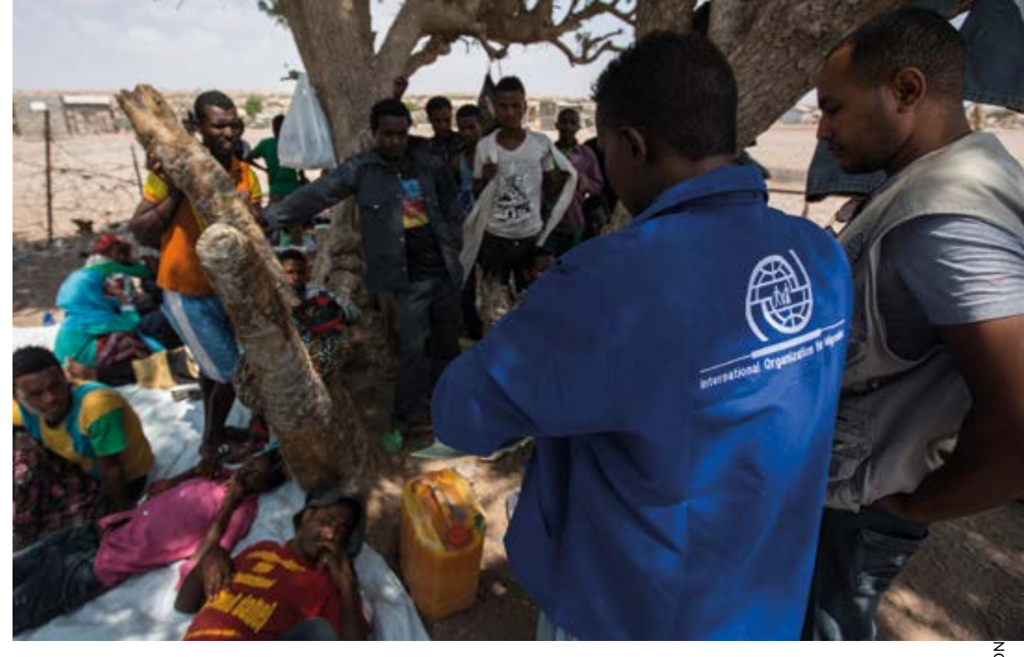
At the migration response centre in Obock, Djibouti, efforts of the IOM to dissuade Ethiopian migrants from risking the crossing through war-stricken Yemen have resonated with many who eventually accept IOM's assistance to return to their home country.